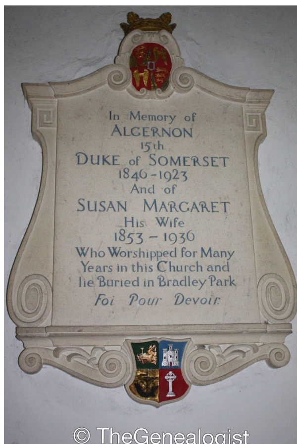
One of a number of headstones and plaques for the Dukes of Somerset and their family in All Saints, Church Street, Maiden Bradley, Wiltshire

These new records are all available as part of the Diamond Subscription at TheGenealogist .